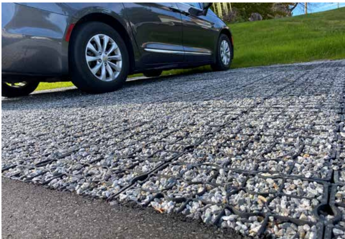
Stone filled E40