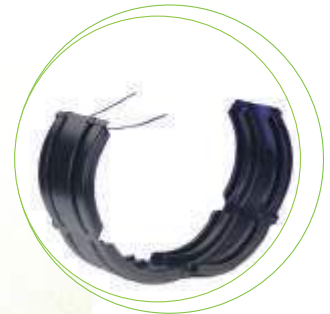
3" - 24" Split Band Coupler

**Pipe O.D. values are provided for reference purposes only, values stated for 3- through 24-inch are \pm 0.5 inch. Contact a sales representative for exact values.