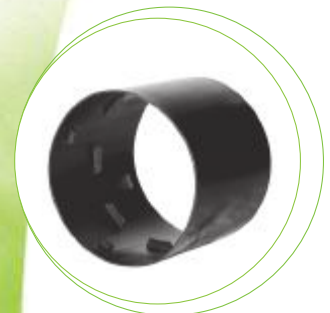
3" - 10" External Snap Coupler