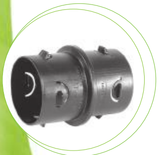
3" - 8" Internal Snap Coupler